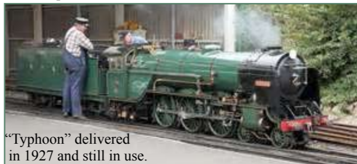
"Typhoon" delivered in 1927 and still in use.

A trip on the railway is quite an experience. The are four stations, with "RH&DR" cast into the seats and the brackets supporting the roof. The line runs parallel with the coast and the tracks cross several roads where there are gates at level crossings stopping the traffic for the one-third size trains to pass.