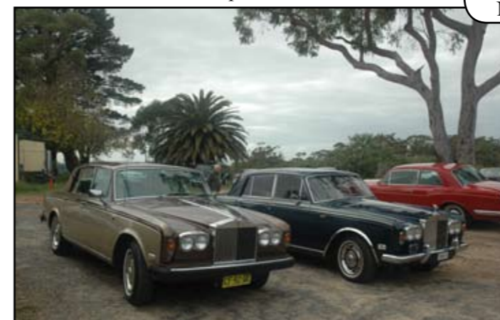
1977 S.Shadow II SRN30408 and 1974 S.S. SRH17499