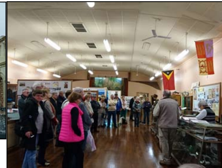
The suggested stop at the Griffith War Memorial Museum and Art Gallery attracted a large crowd.