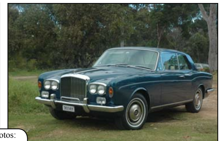
1974 Bentley Corniche CBH16177