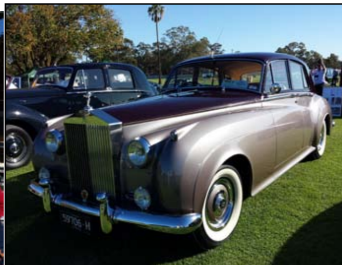
...and finally, what you all wanted to see: The Overall Winner 1957 Silver Cloud SFG121 Owners: George & Fiona Forbes