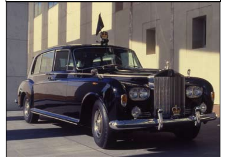
Current photos of the Phantom V show no sign of the damage. It has obviously been expertly repaired.

The newspaper caption for the photograph is, "A police motor-cyclist and a chauffeur try to prise the crumpled mudguard of a Rolls-Royce off the wheel after the Rolls carrying President Ne Win of Burma and a police-escort motor cycle collided in Melbourne yesterday."