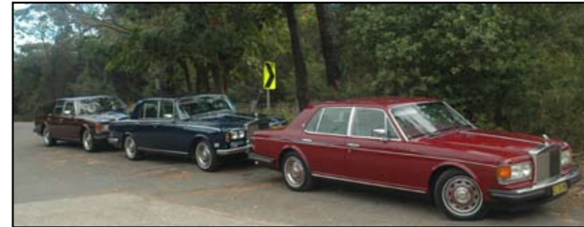
1985 S.Spirit ASF13836, 1972 S.S. SRH12255 & 1987 S.Spirit ASH20455

Sixty members and friends met at 'Pie in the Sky', amongst the bikers, to form a convoy to drive to Gosford. The parking lot could have been mistaken for a Museum in its own right