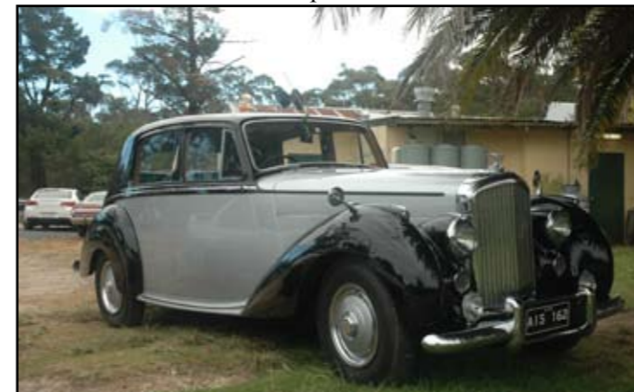
1951 Mark VI B2KM