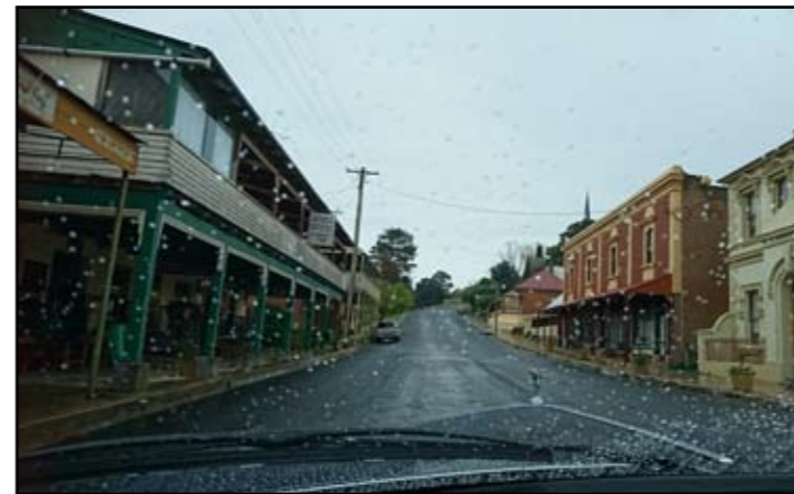
One of the joys of being on an Overlander is driving through small typical country towns such as Carcoar and...