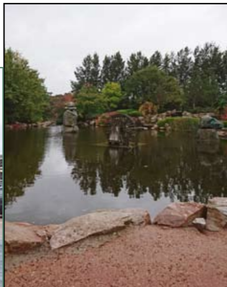
No visitor to this part of the world should miss the Lambing Flat Chinese Tribute Garden in Young.

It is getting difficult for organisers of Overlanders to find routes that offer new driving experiences and new venues. Seasoned Overlanders seem to have visited every historic house, every winery and motor museum at least in NSW!