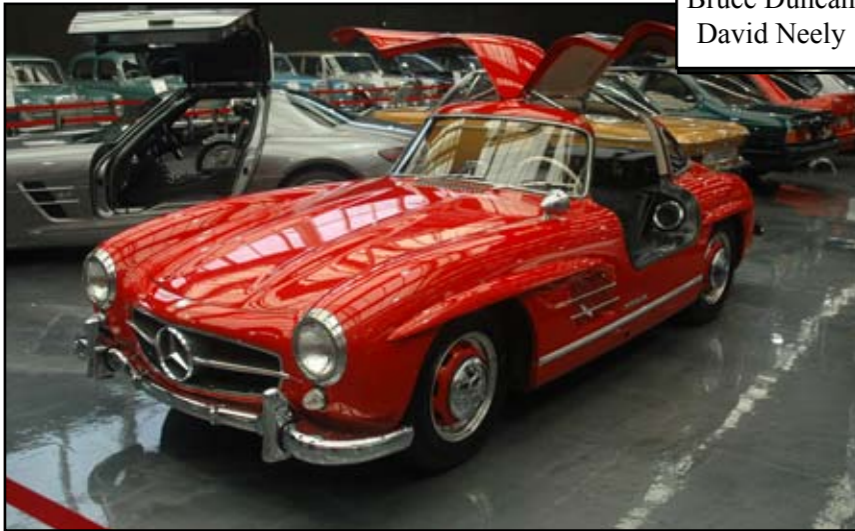
Maybe this one should be in an aircraft museum.