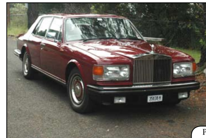
1984 S.Spirit ASE10043