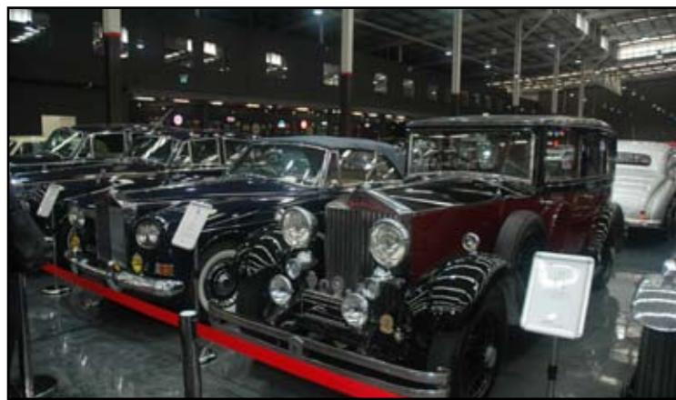
There are rows and rows of Rolls-Royces and Bentleys