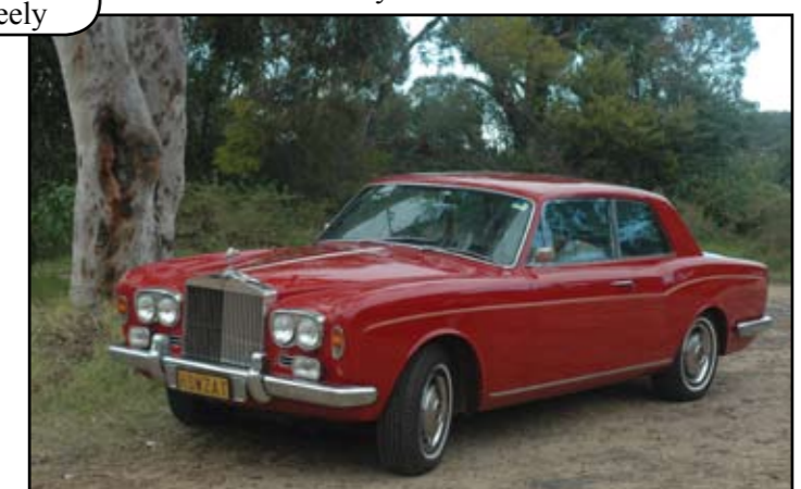
1969 S.Shadow CRH5064