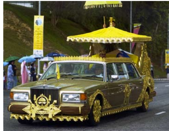
Ken Swinbourne's suggestion: What to buy when you trade in your elephant!