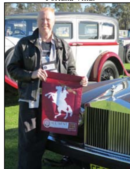
Above: D2M2 shows Florida State University alumni flag.