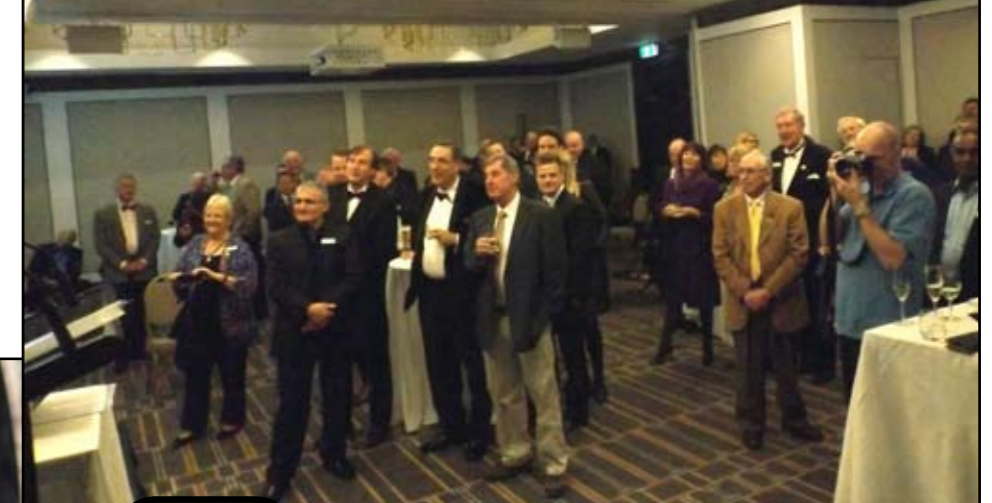
Just part of the crowd watching the proceedings