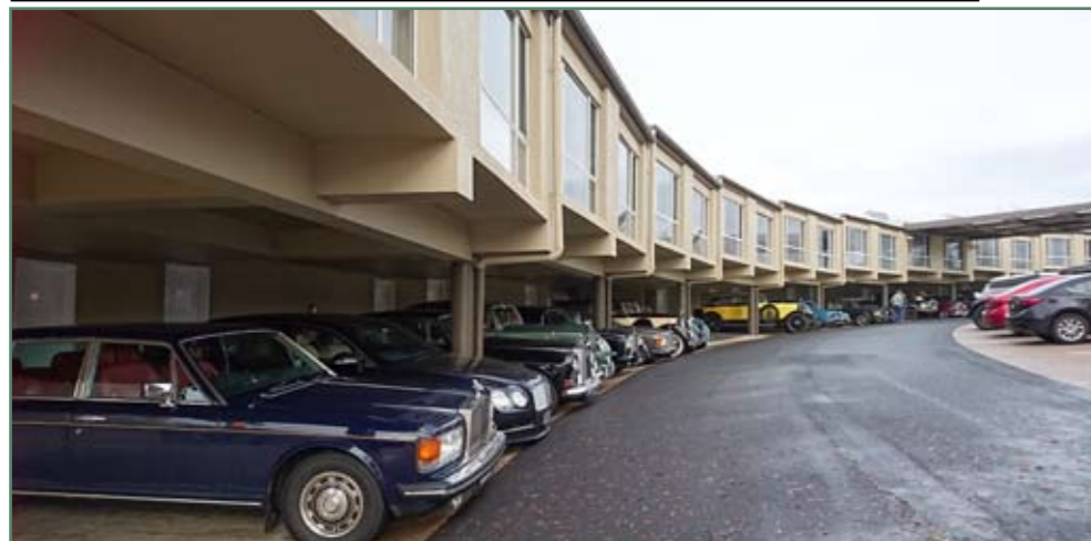
Rolls-Royces and Bentleys as far as the eye can see!