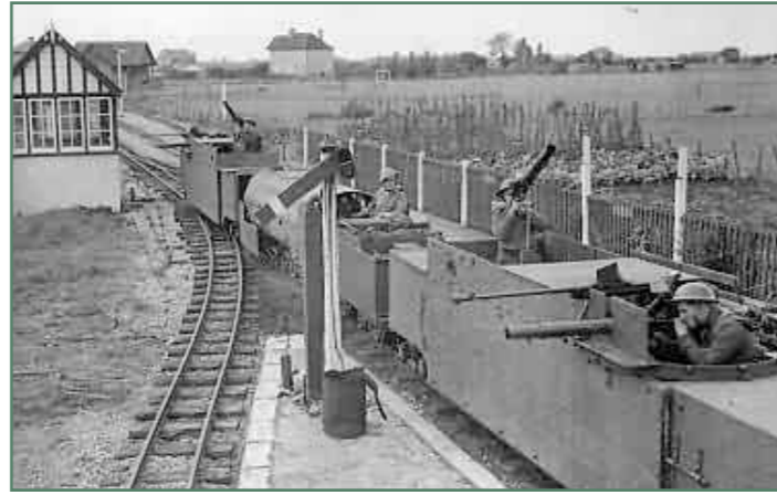
The armoured train on the RH&DR The Rolls-Royce locomotive. The radiator looks as if it comes from a 20/25 or a P II, so perhaps this is the replacement engine, and not the one from the Silver Ghost.

The railway runs a regular time-tabled public passenger service, which included a school train for about eighteen years ending in July, 2015, and freight services. It still is licensed for postal services and has a parcel delivery service. The original locomotives are still in use, and the fleet now comprises fourteen locomotives, including two diesels.