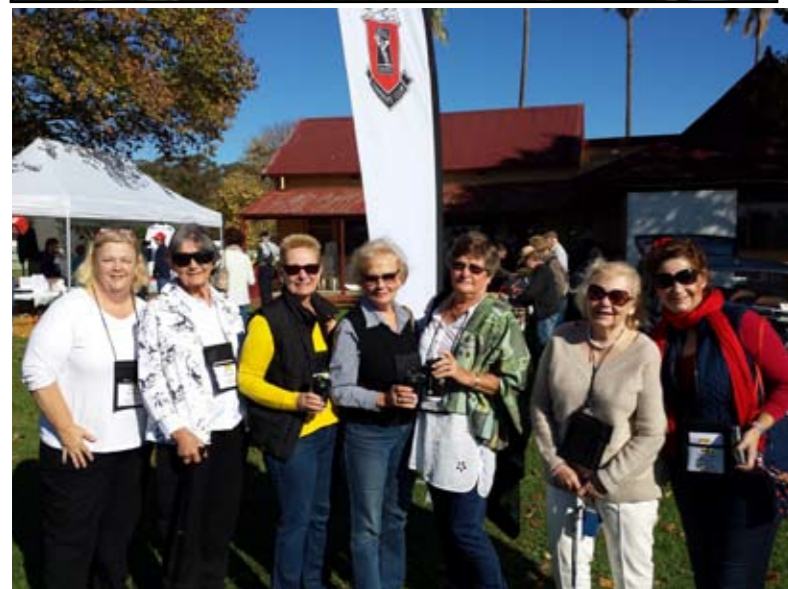
Above: Once again the ladies rallied around the flag.