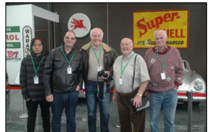
A more unlikely-looking bunch of car salesmen we have yet to see!