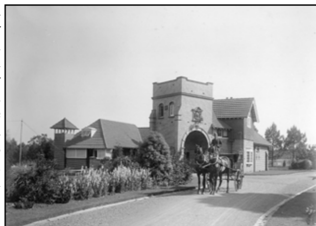
Above: The stables at 'Yaralla'.