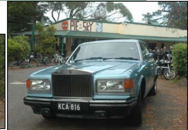
1989 S.Spirit ASK26816