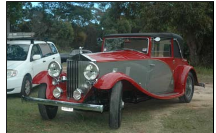
1938 25/20 H.P. GGR45